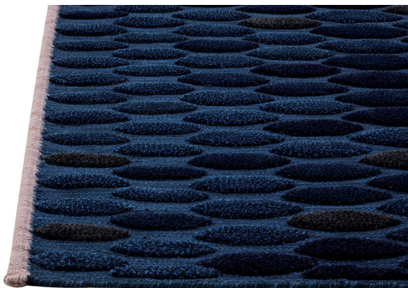
Pond flossa midnight

POND FLOSSA - Pond is a tactile collection of handwoven rugs with a variation of heights and structures. The pattern is an abstraction of a fish shoal, tightly organized and coordinated in precise arrangements. Fast moving shoals usually form a wedge shape while shoals that are travelling can form squares. This has been interpreted in a collection of handwoven rugs in various colours. Charlotte von der Lancken has worked in close collaboration with Kateha and their weavers, using a combination of weaving techniques in order to achieve the diamond shaped rug and the different heights with handwoven pile. Pond pile rug has a finish of woven hemmed wool edges in a contrasting colour.