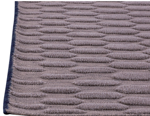
Pond flossa winter