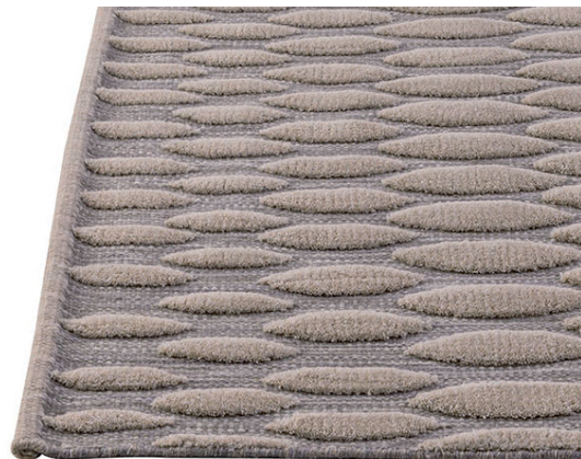
Pond flossa snow

Product: Handwoven semi pile rug in finest New Zealand wool.