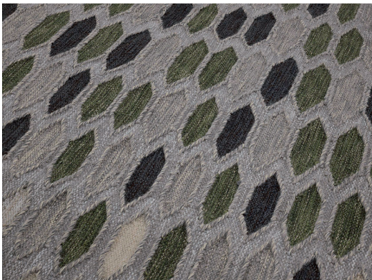
Pond Soumak garden (detail)

POND SOUMAK - Pond is a tactile collection of handwoven rugs with a variation of heights and structures. The pattern is an abstraction of a fish shoal, tightly organized and coordinated in precise arrangements. Fast moving shoals usually form a wedge shape while shoals that are travelling can form squares. This has been interpreted in a collection of handwoven rugs in various colours. Charlotte von der Lancken has worked in close collaboration with Kateha and their weavers, using a combination of weaving techniques in order to achieve the diamond shaped rug and the outlines through soumak-twist weaving. Pond soumak is edged with woven hemmed wool edges in a contrasting colour.