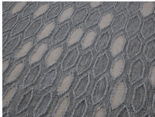
Pond Soumak margarita (detail)